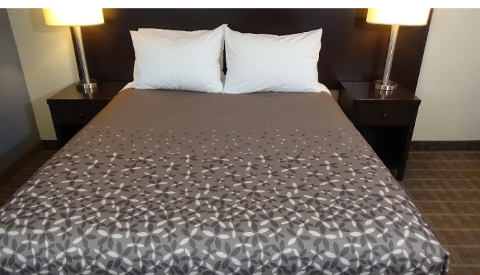
"Love me not" Decorative Top Sheet Grey on Grey