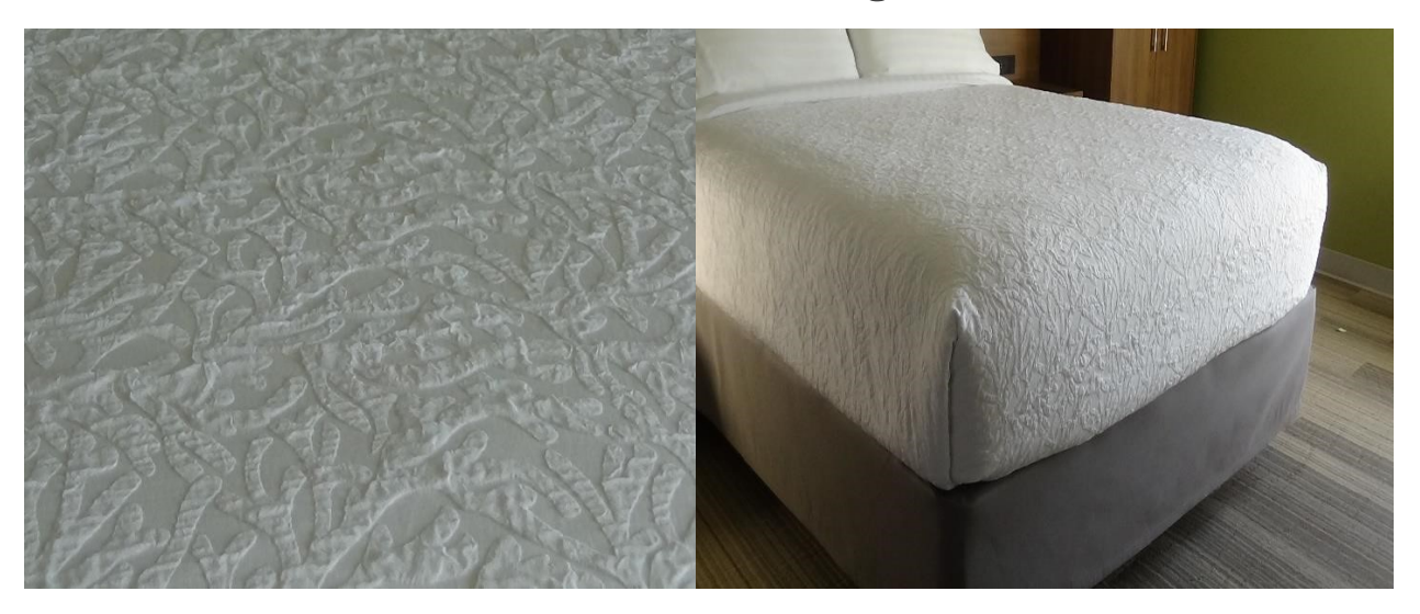
Ariel Top Sheet