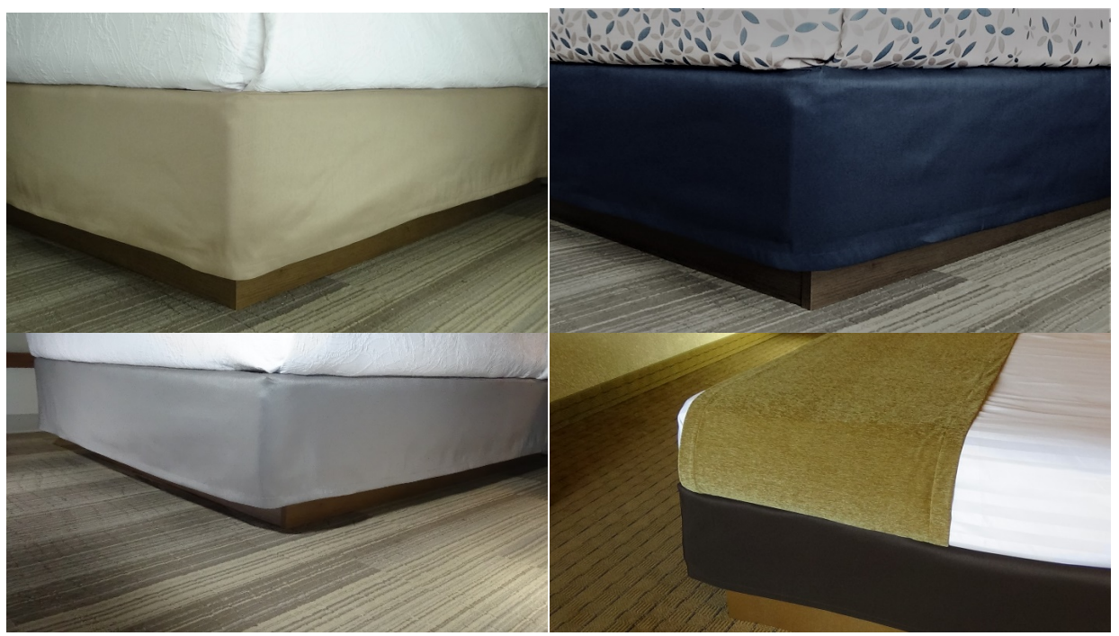
Shantung Box Spring Cover