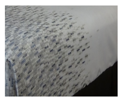
"Tecnichrome" Decorative Top Sheet Color "Neutral Metallic"