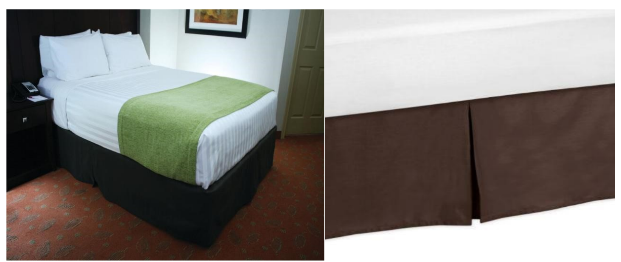
Shantung Bed Skirt